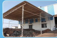
Waste Dumping Yard