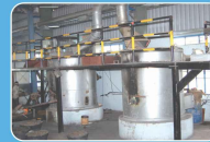
Refining & Alloying Pots